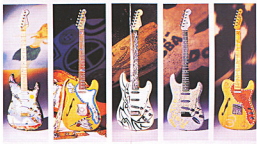
Catalogue 1996 (left) This shot from the Custom Shop catalogue emphasises the Shop's ability to turn a guitarist's fevered imagination into solid guitar decoration, whether it's a bead-encrusted Native American art object or a Flinstones Strat (a rock guitar to join Wilma's fabulous Stoneyway piano).