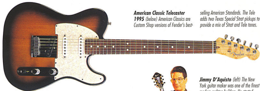
American Classic Telecaster 1995 (below) American Classics are Custom Shop versions of Fender's best-

selling American Standards. The Tele adds two Texas Special Strat pickups to provide a mix of Strat and Tele tones.