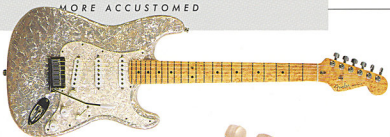
Moto Strat 1995 (right) This Custom Shop limited edition is finished in plastic pearl substitute, or "moto" — short for "mother of toilet seat".