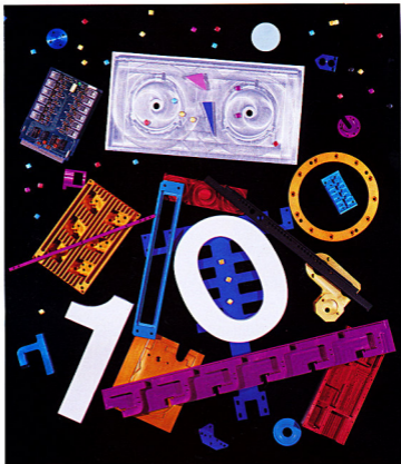
Ten, 1991 anodized aluminum collage, 36 x 32 in.